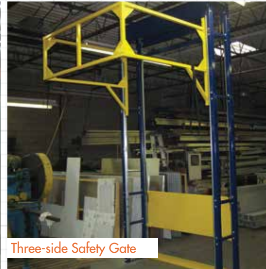
Three-side Safety Gate