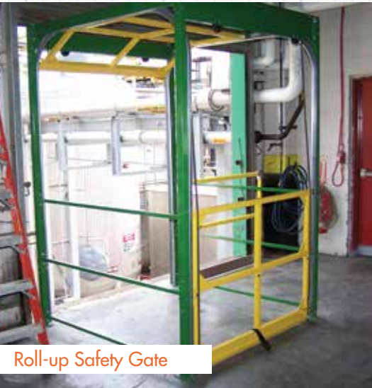
Roll-up Safety Gate

Mezzanines are an often overlooked hazard in warehouses and industrial applications. Guard-railing can be installed to protect the mezzanines; however, the mezzanines are often used for storage and a safe means of transporting materials to and from the mezzanine areas needs to be addressed. Our mezzanine safety gates offer protection 100% of the time, when one gate is up, the second gate is down protecting the opening. A skid can be moved into the area of the safety gate and then the opposite side of the gate is raised to allow a fork-lift truck or other equipment to move equipment from the mezzanine to the ground level or from the ground level onto the mezzanine. Our mezzanine gates are custom designed and manufactured to suit the customer's unique requirements and existing applications. The pivot model safety gate is also another great option for mezzanine guarding.