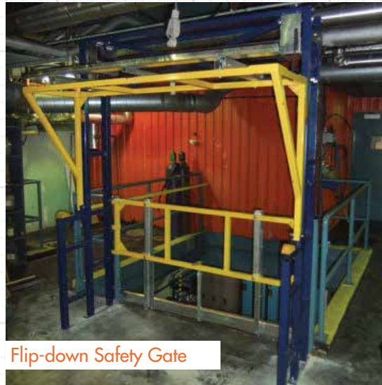
Flip-down Safety Gate