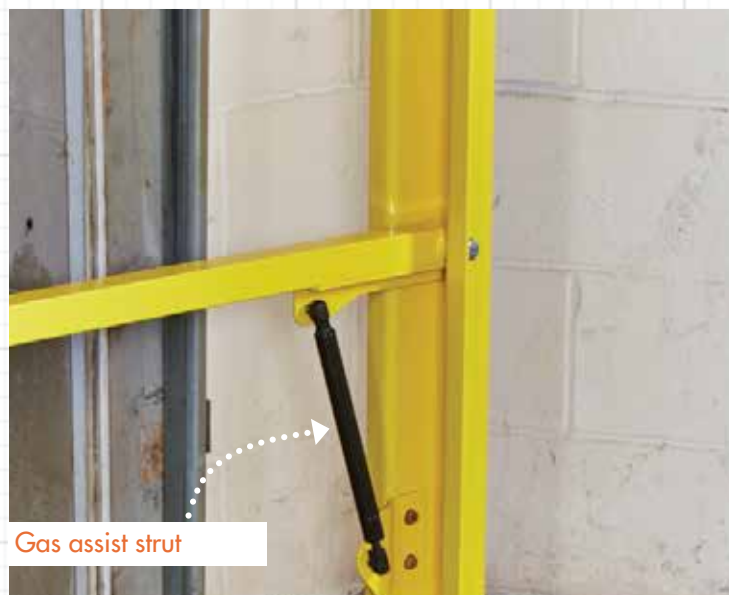
Gas assist strut