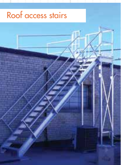
Roof access stairs

Crossover stairs on a rooftop make travelling over obstructions such as parapets, pipes, ducts, or other obstructions on a roof, much easier and safer. The crossover stairs are custom-made for each application and fabricated from aluminum to keep them lightweight and the additional load on the roof minimal. The crossover stairs can be incorporated with the Safety Rail 2000 system, utilizing the same rails and bases to allow for complete rooftop guardrail protection. They can also be integrated with the Perma-Line system.